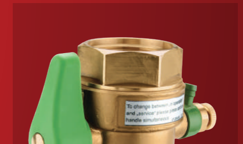
1/4" DRAIN PLUG