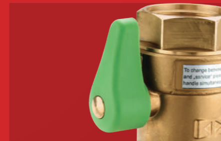
INCLUDES BALL VALVE For simple maintenance