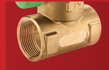
ROTATABLE TEE-PIECE 3/4" version